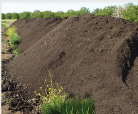
240 TONS BULK COMPOST/MANURE

Results in 0.5 - 1lb of soluble humus per ton for soil amending benefits