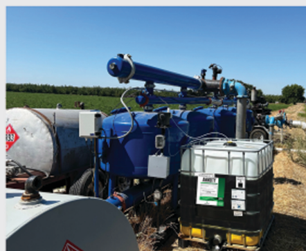
240 GALS LIQUID ANNUITY