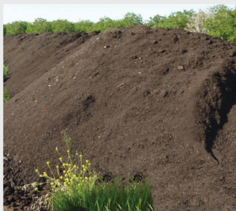
240 TONS BULK COMPOST/MANURE

Results in 0.5 - 1lb of soluble humus per ton for soil amending benefits