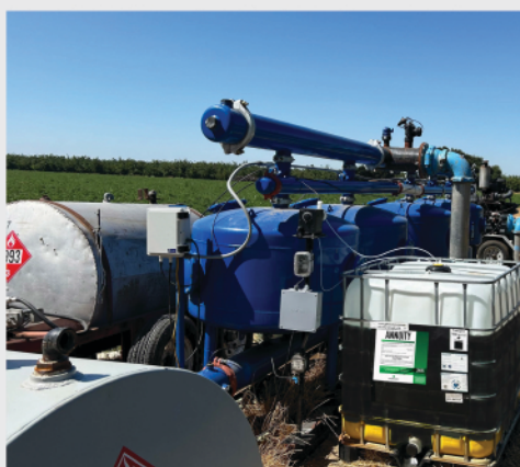
240 GALS LIQUID ANNUITY